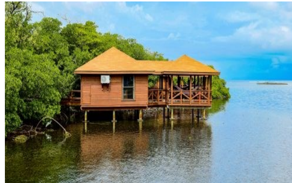
On Water Bungalows