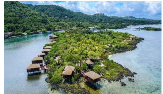
Key Island Bungalows